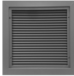
600A1 Photo & Drawing

Inverted "V" Blades with 60% Free Area - Recommended for Schools, Class "A" and Institutional Buildings