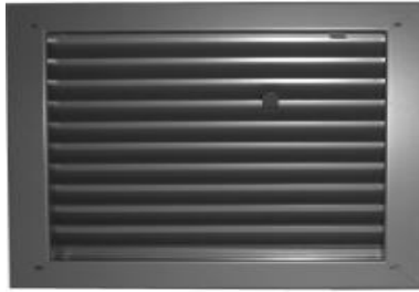
1100A Photo & Drawing